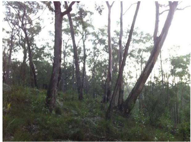
Spot Assessment 196