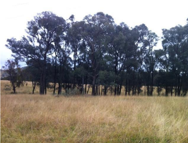
Spot Assessment 125