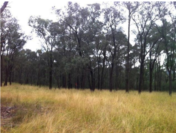
Spot Assessment 143