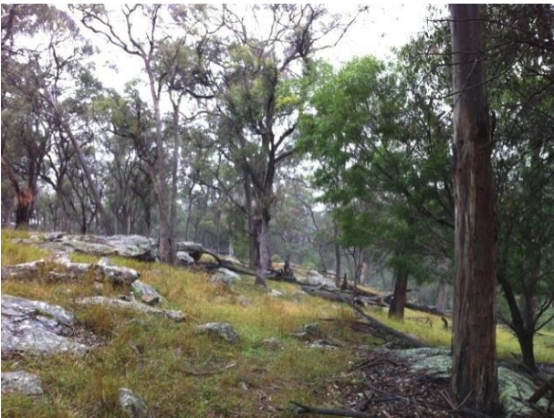
Spot Assessment 177