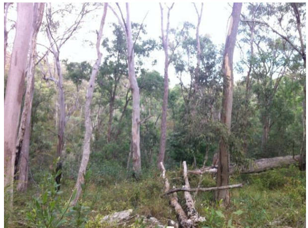
Spot Assessment 228