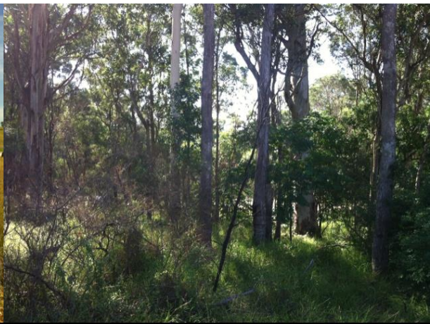
Spot Assessment 4