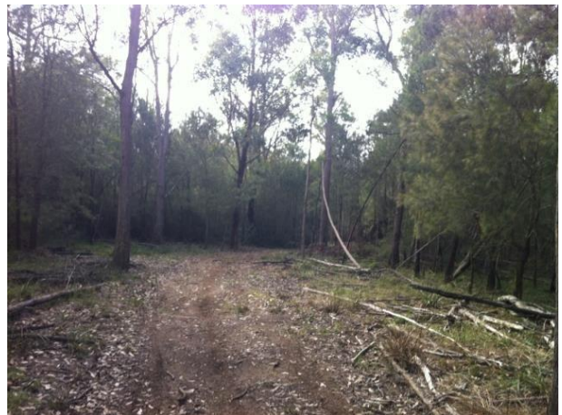
Spot Assessment 232