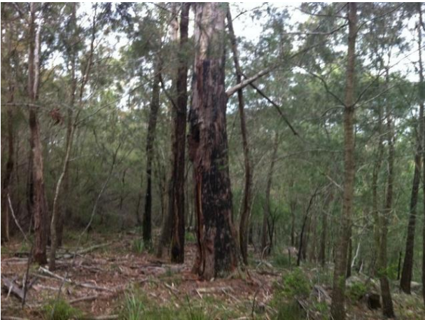
Spot Assessment 207