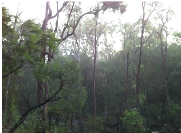
Spot Assessment 198