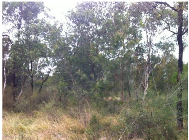
Spot Assessment 250