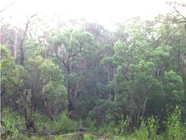
Spot Assessment 197