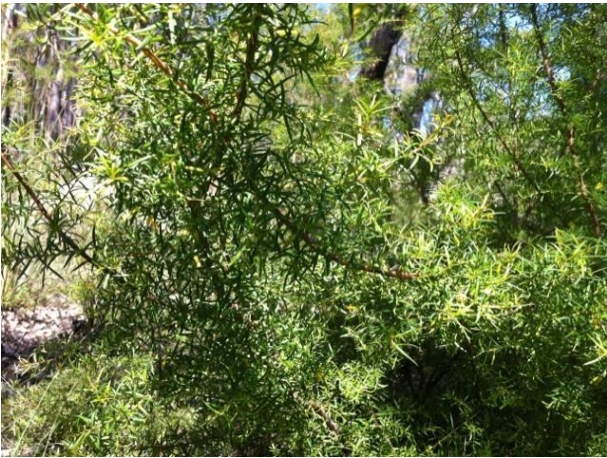
Spot Assessment 181