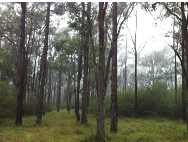
Spot Assessment 167