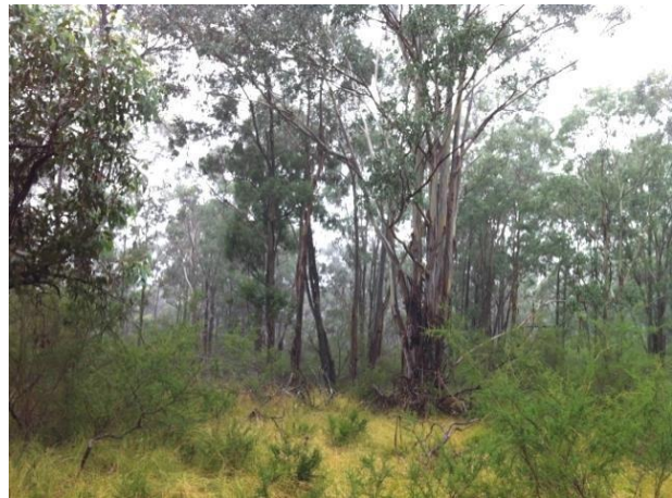
Spot Assessment 166