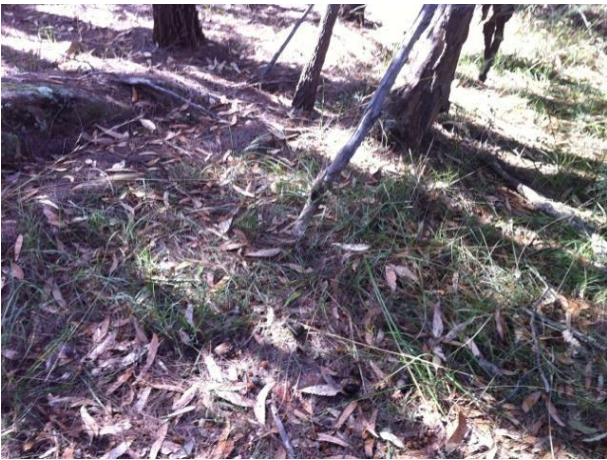
Spot Assessment 219