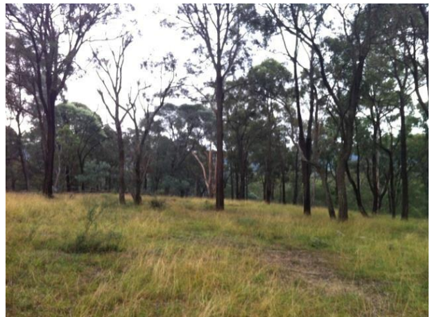
Spot Assessment 142