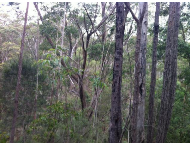
Spot Assessment 203