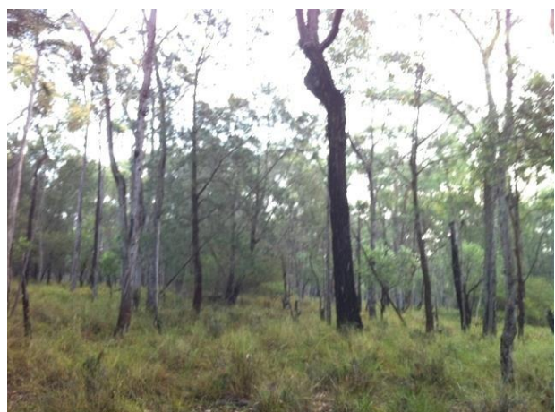
Spot Assessment 192