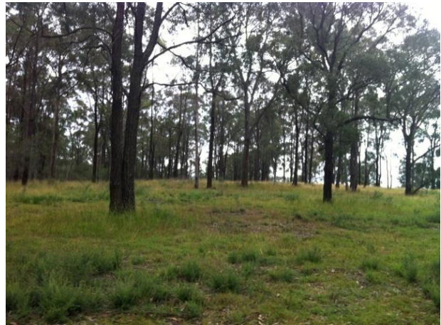
Spot Assessment 124