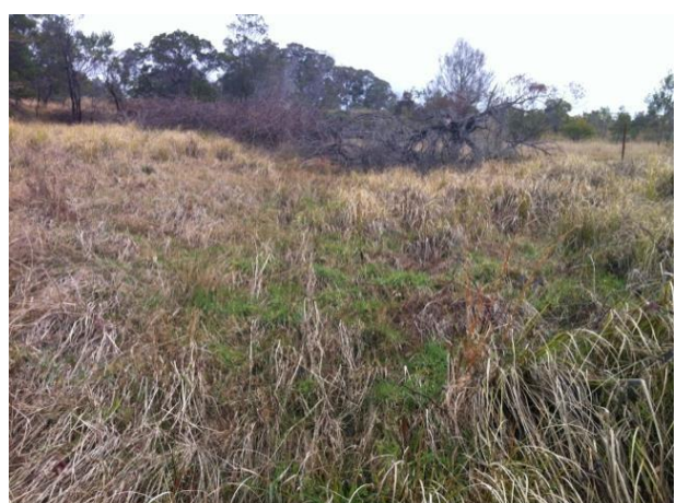
Spot Assessment 246