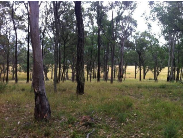
Spot Assessment 123