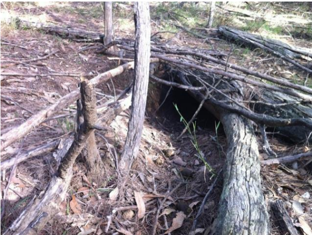
Spot Assessment 233