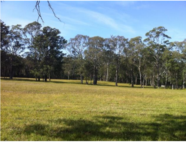
Spot Assessment 1