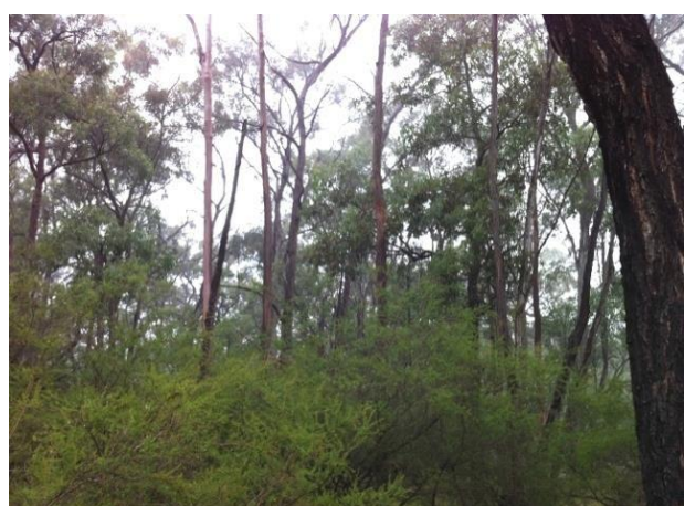
Spot Assessment 174