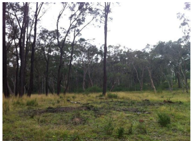
Spot Assessment 144