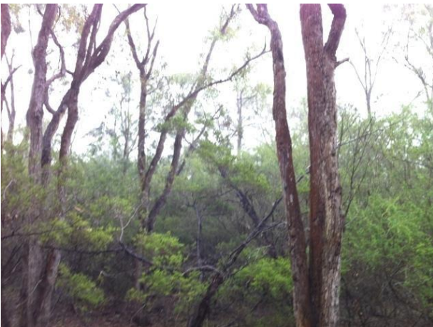
Spot Assessment 165