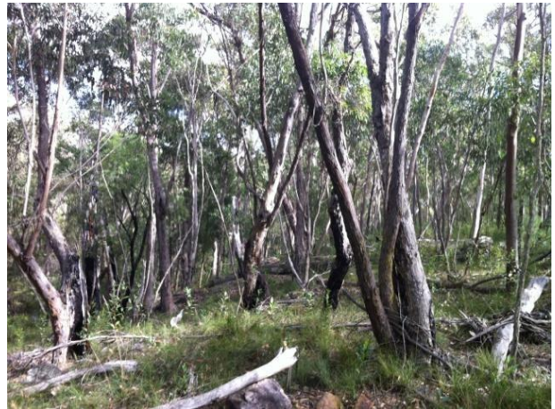
Spot Assessment 226