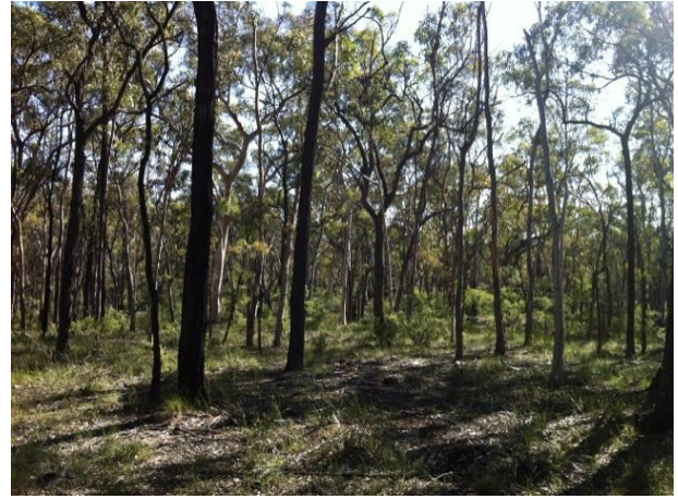
Spot Assessment 146