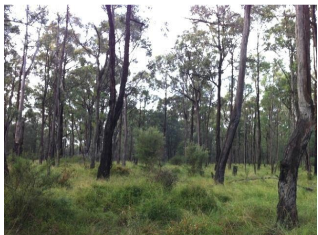
Spot Assessment 184