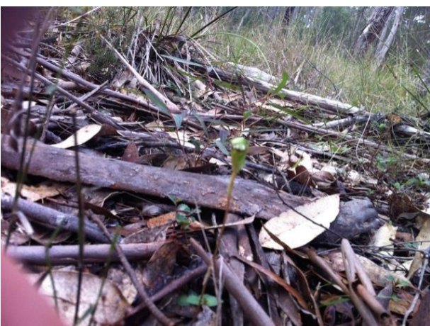
Spot Assessment 215