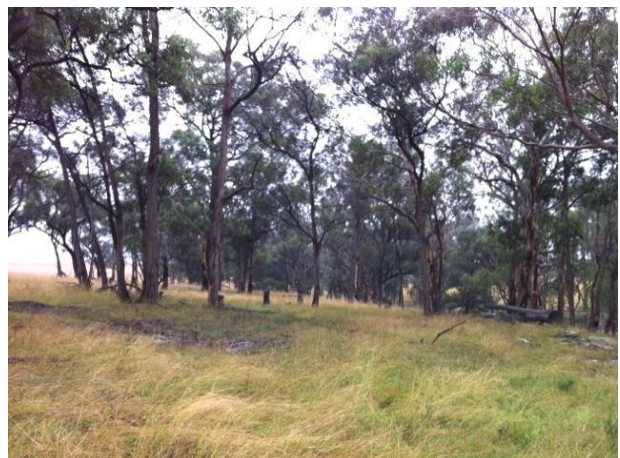
Spot Assessment 178