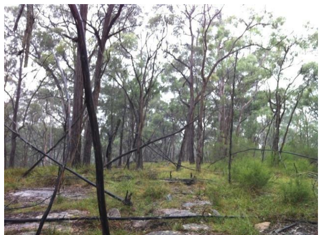
Spot Assessment 162