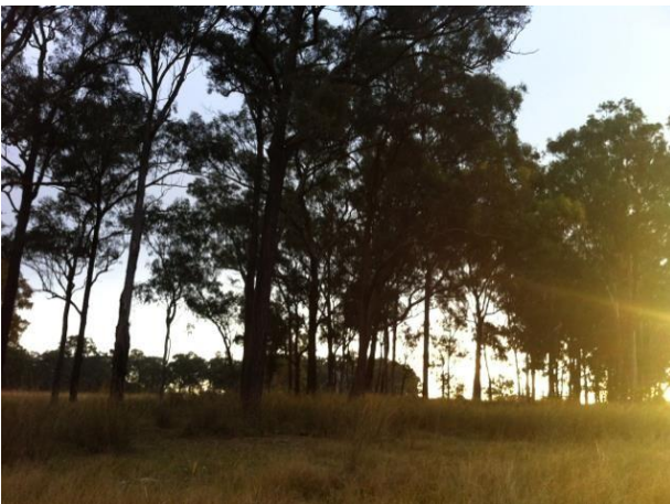
Spot Assessment 149