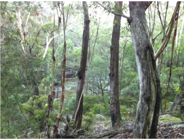
Spot Assessment 189