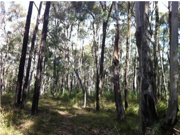
Spot Assessment 225