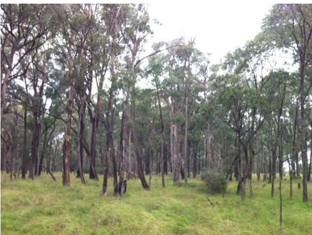
Spot Assessment 185