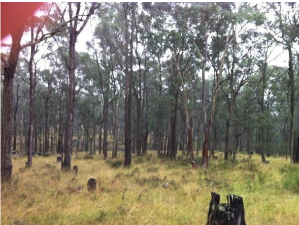
Spot Assessment 159