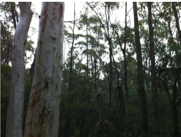
Spot Assessment 191