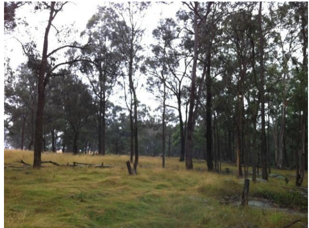
Spot Assessment 156