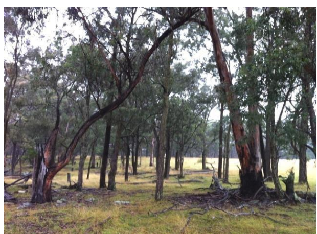
Spot Assessment 180