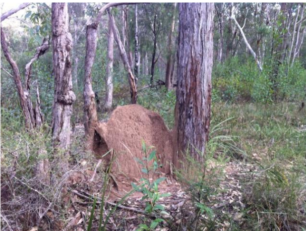
Spot Assessment 227