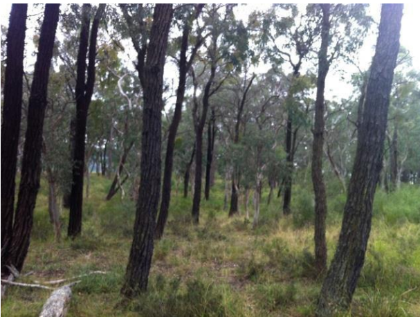
Spot Assessment 129