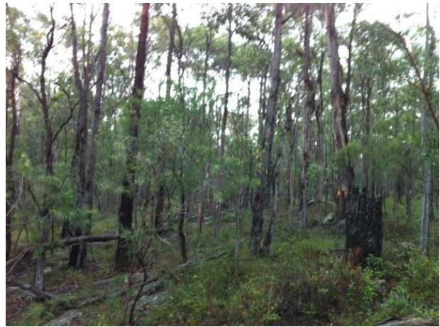
Spot Assessment 190