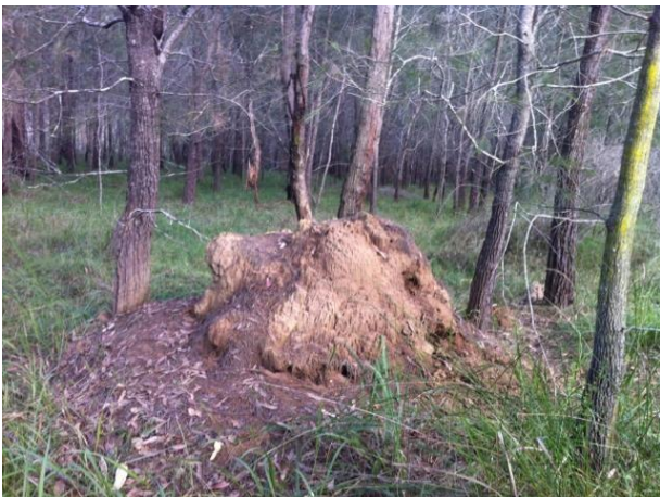
Spot Assessment 243