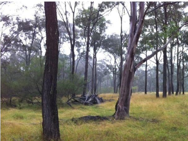
Spot Assessment 173