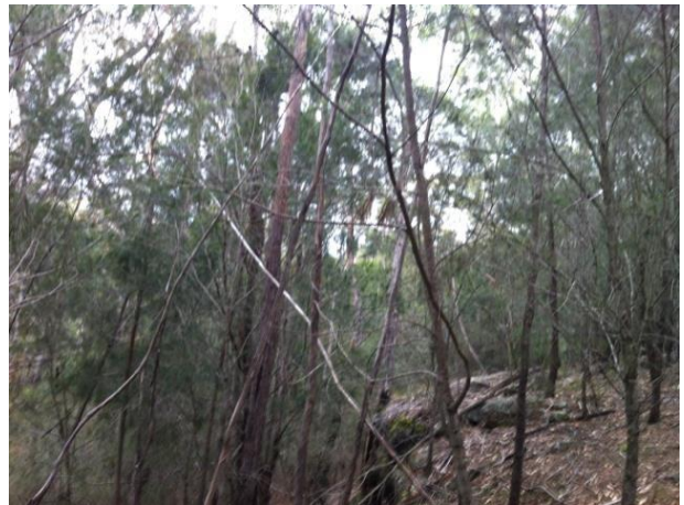
Spot Assessment 202