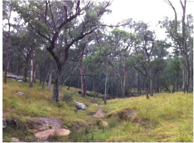
Spot Assessment 154