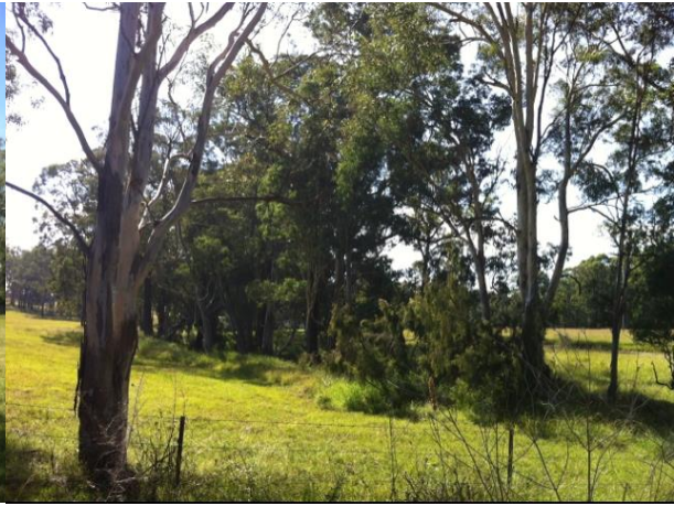
Spot Assessment 2