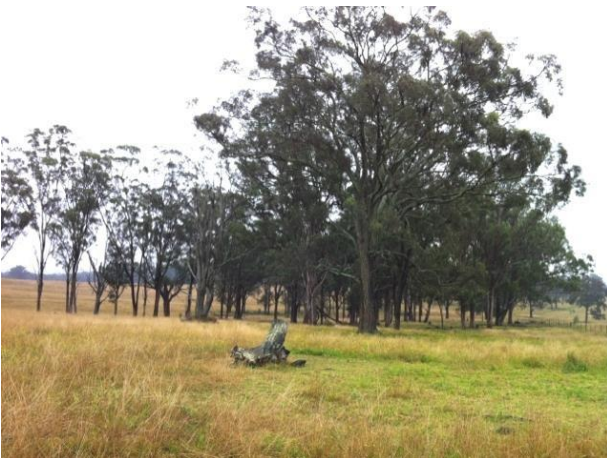
Spot Assessment 183