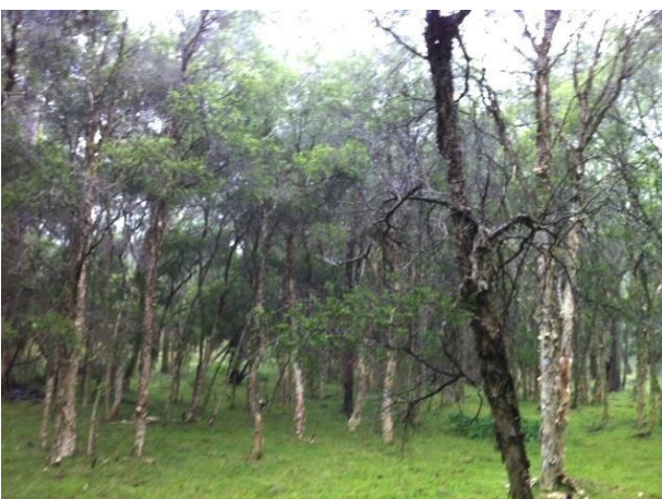
Spot Assessment 161