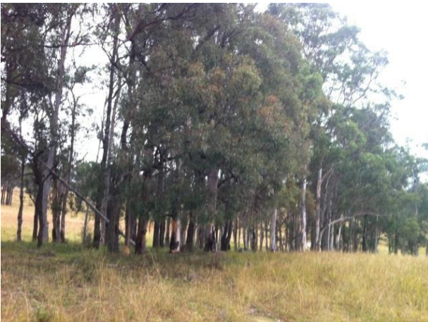
Spot Assessment 135