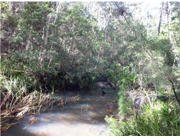
Spot Assessment 221