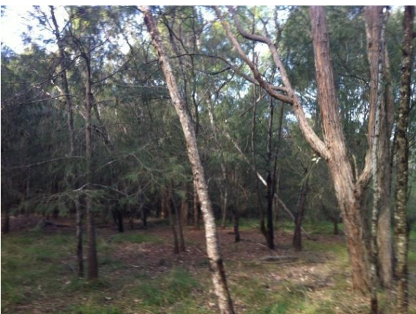
Spot Assessment 239