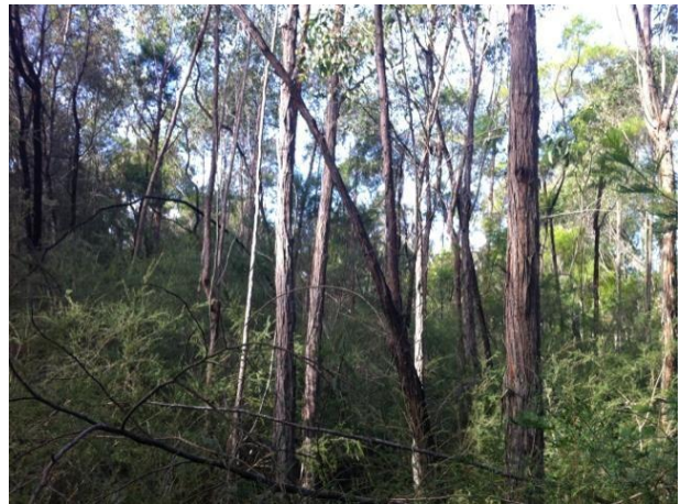
Spot Assessment 240