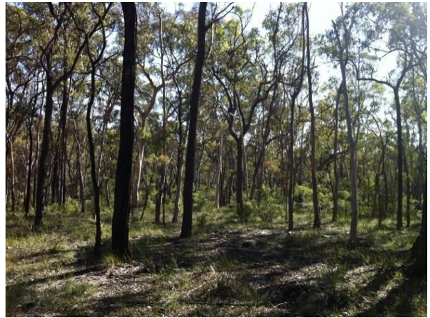
Spot Assessment 182