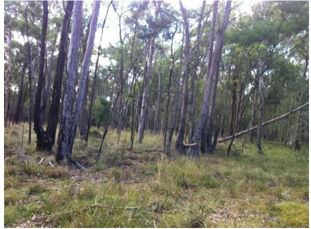
Spot Assessment 214