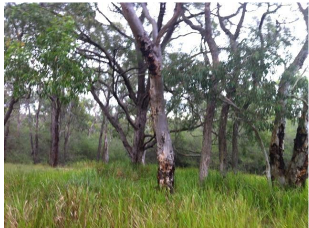
Spot Assessment 130