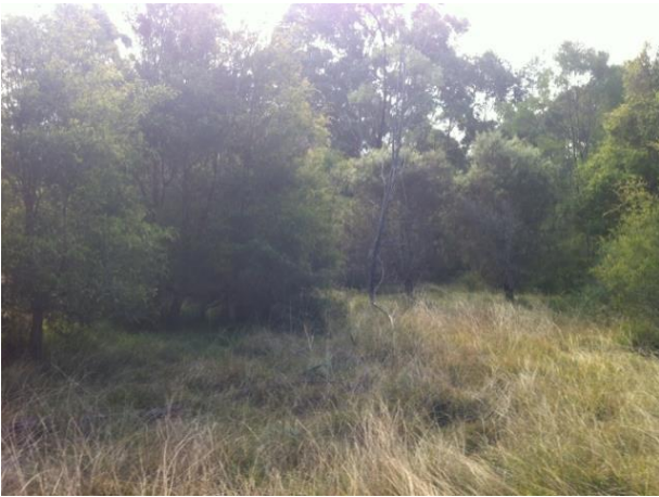
Spot Assessment 237