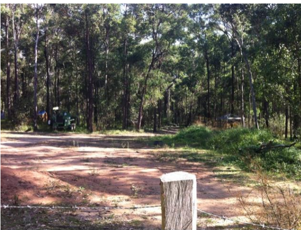
Spot Assessment 5