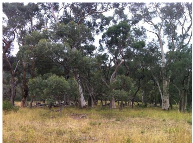
Spot Assessment 132