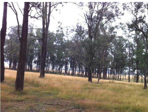
Spot Assessment 155