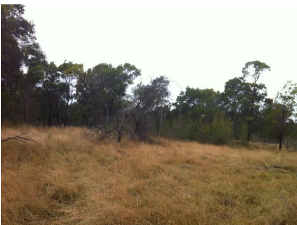
Spot Assessment 245