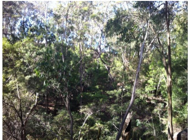
Spot Assessment 222