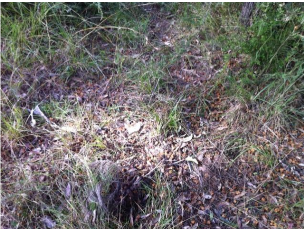
Spot Assessment 213