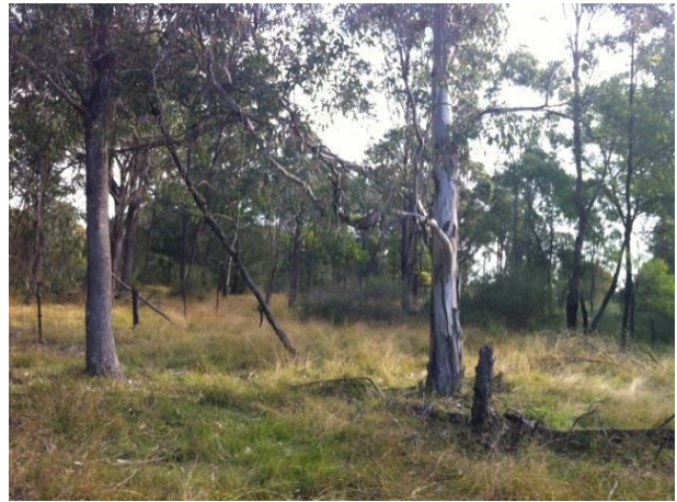
Spot Assessment 238