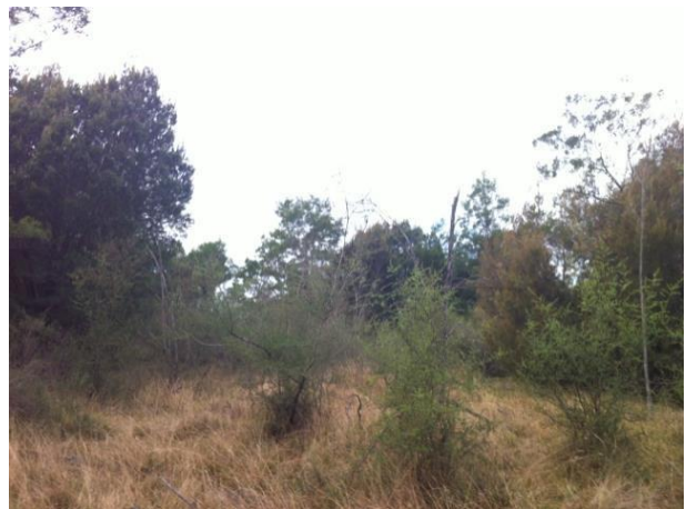
Spot Assessment 244