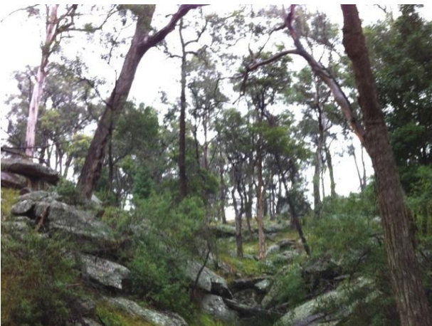
Spot Assessment 179