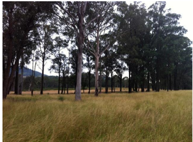
Spot Assessment 136