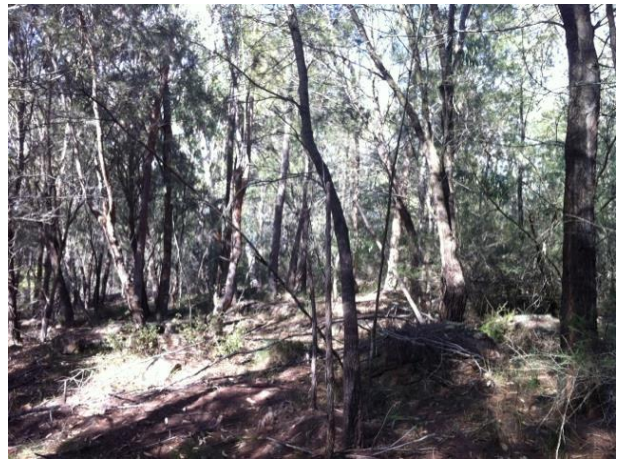
Spot Assessment 220