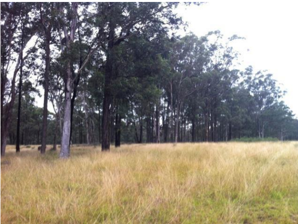
Spot Assessment 141