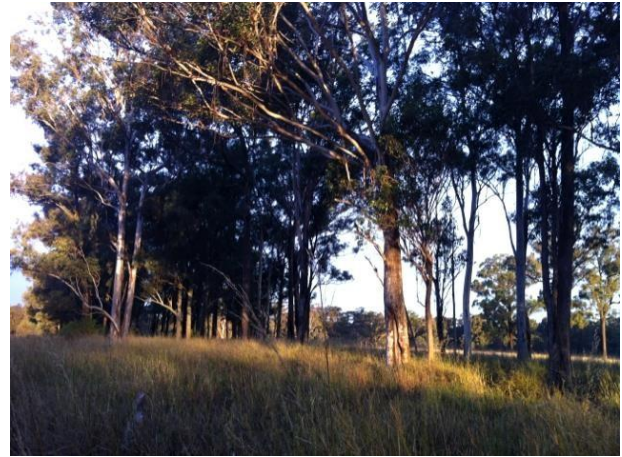
Spot Assessment 150