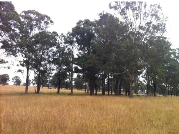
Spot Assessment 137