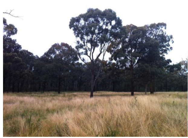
Spot Assessment 148