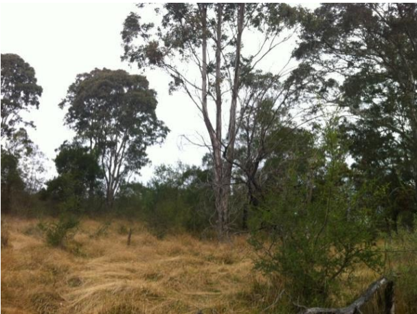
Spot Assessment 249