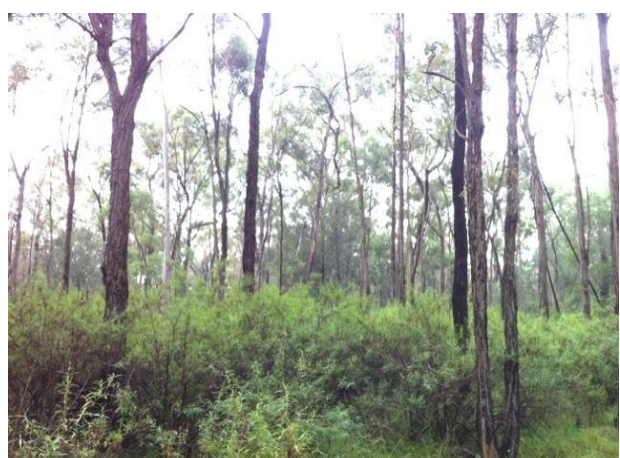
Spot Assessment 186