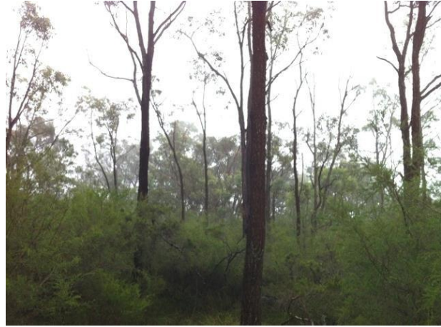
Spot Assessment 168