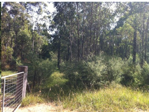
Spot Assessment 6