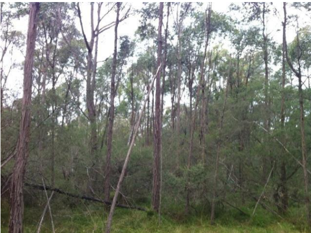
Spot Assessment 209