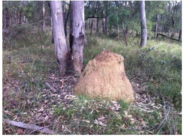
Spot Assessment 216