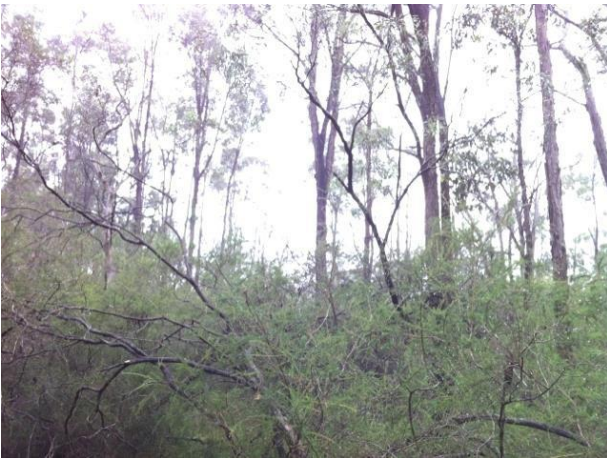
Spot Assessment 171