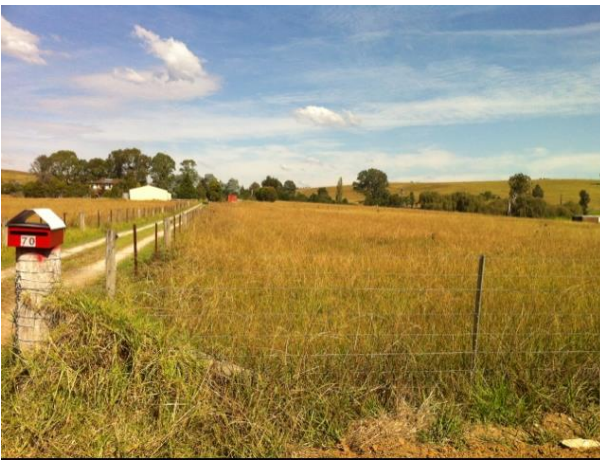
Spot Assessment 3