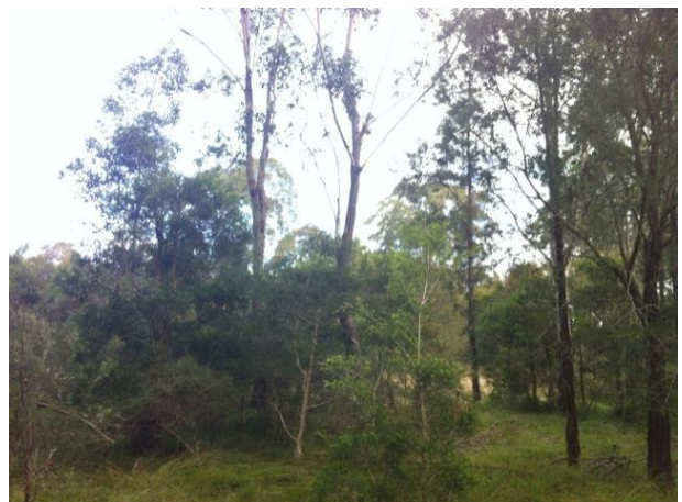
Spot Assessment 234