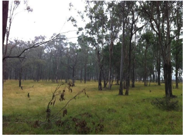
Spot Assessment 160