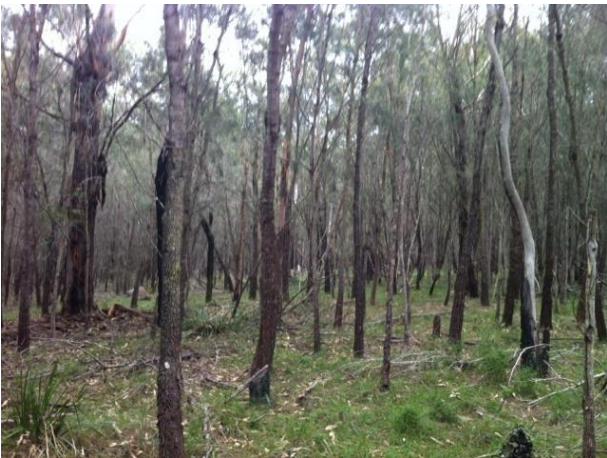
Spot Assessment 201