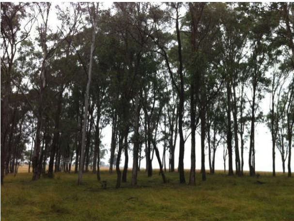
Spot Assessment 153