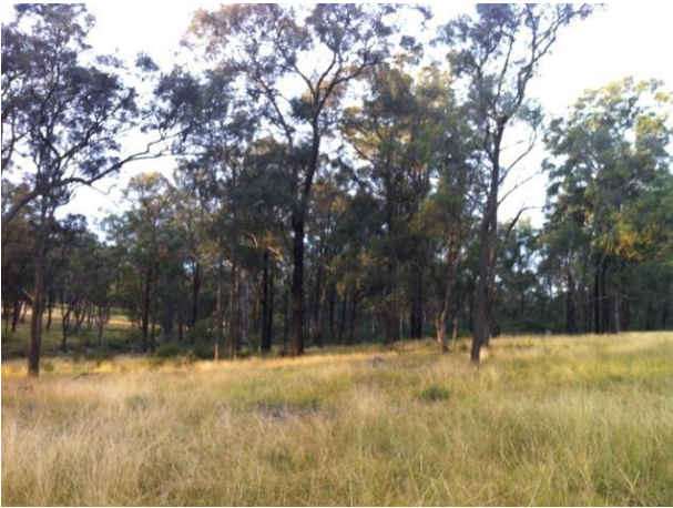
Spot Assessment 147