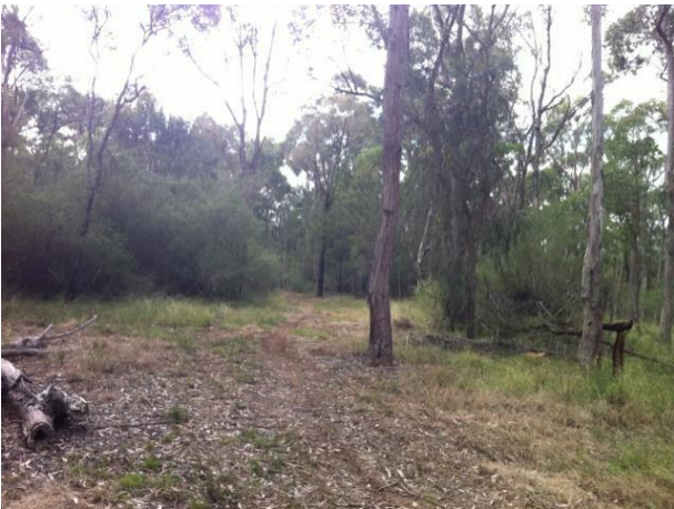
Spot Assessment 231