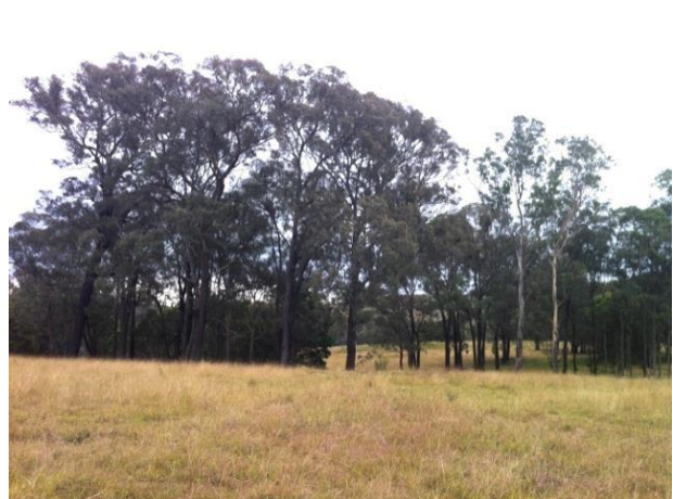
Spot Assessment 126