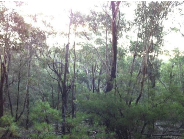
Spot Assessment 195