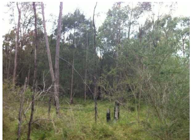
Spot Assessment 210