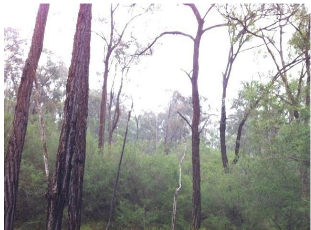
Spot Assessment 172