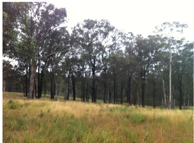
Spot Assessment 138