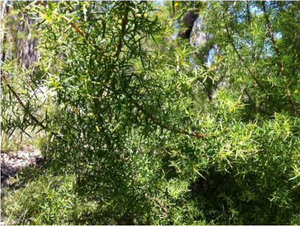
Spot Assessment 247